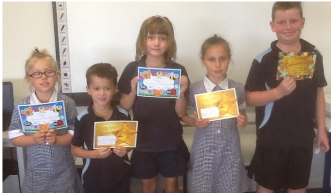
Award winners for week 3