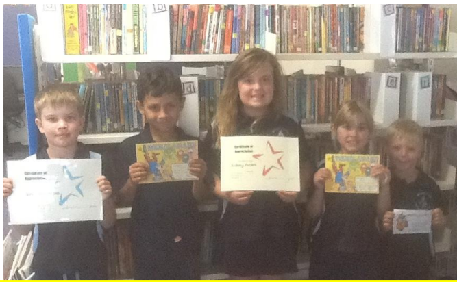
Award winners for week 2